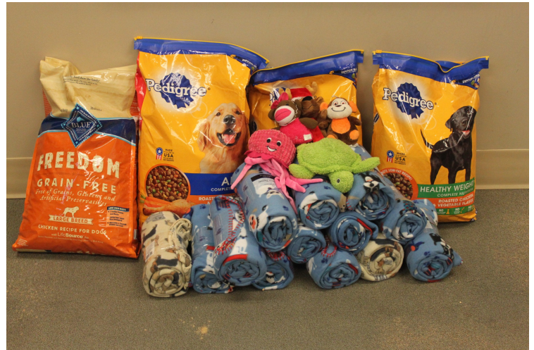
Above: Food and blanket donations.

All of these supplies were donated to Prevent Homeless Pets, a volunteer-run non-profit spay and neuter clinic located in Benton City, along with dozens of towels and wash cloths that our shelter didn't need.