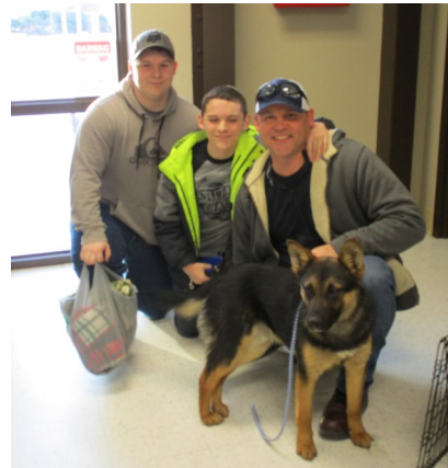
Left: A new forever family for one of our pups!