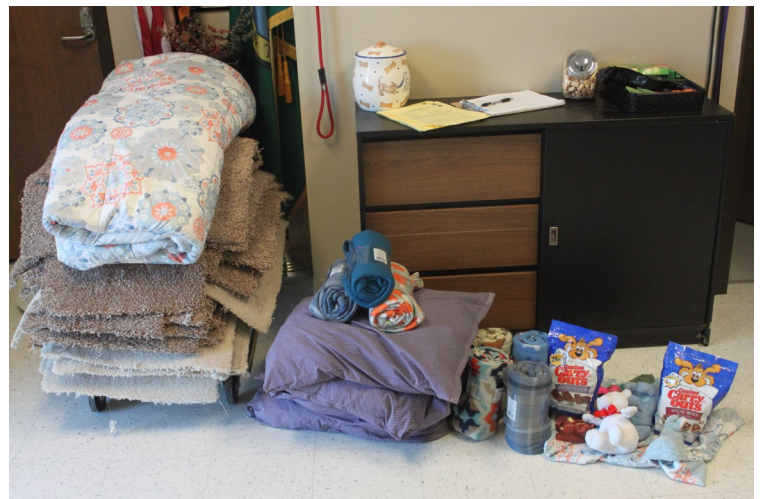
Below: Blanket and treat donations.

THANK YOU TO THE FOLLOWING ORGANIZATIONS, YOUR SUPPORT AND HELP IS GREATLY APPRECIATED!