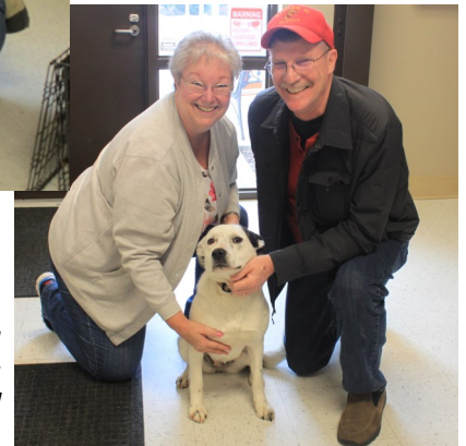
Right: Another dog heading home with his forever family!